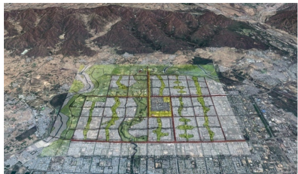
Brasilia City, Brazil and Chandigarh, India