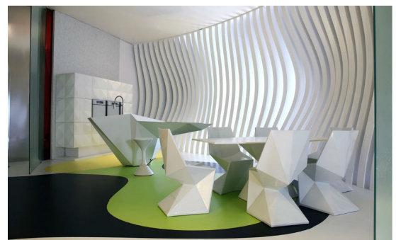
Karim Rashid's interior design portfolio expands beyond product to interiors such as the Morimoto restaurant, Philadelphia; Semiramis Hotel, Athens; Nhow Hotel, Berlin. These dining chairs belong to the Vertex Collection and were used in a restaurant to complement the bold colours from the walls.

City planners help cities plan for the growth and redevelopment of city spaces. This process is often called urban renewal. One part of urban renewal is preserving historic buildings. City planners give advice on how to use land and improve basic services such as transportation. They try to solve problems by working with many different groups and specialists. They consult neighborhood groups, business people and technicians such as engineers. Some city planners design entirely new communities.