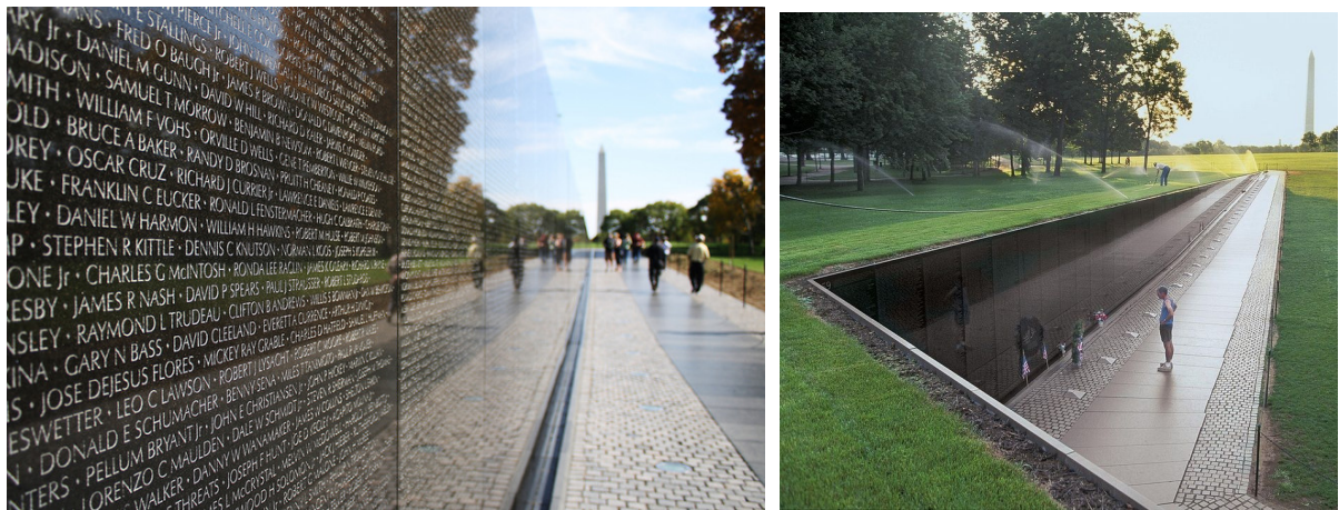
Maya Ying Lin, Vietnam Veterans Memorial, 1980-1982. Black Granite. Constitution Gardens, Washington, DC.

Architecture is the art of planning buildings and spaces for people. The buildings must be well-constructed and practical to use. They also must be aesthetically pleasing - they must fit into the community and have special meaning to the people who see and use them. Some architects work for homeowners. Others specialize in design for offices, hotels, stores, hospitals, or government buildings. Architects have an excellent background in mathematics and are interested in three-dimensional design on a large scale. Most have drawing skills. Many are now using computers as tools to help design buildings. Landscape architects design outdoor spaces. These include parks, areas around buildings, play areas, natural preserves, and golf courses.