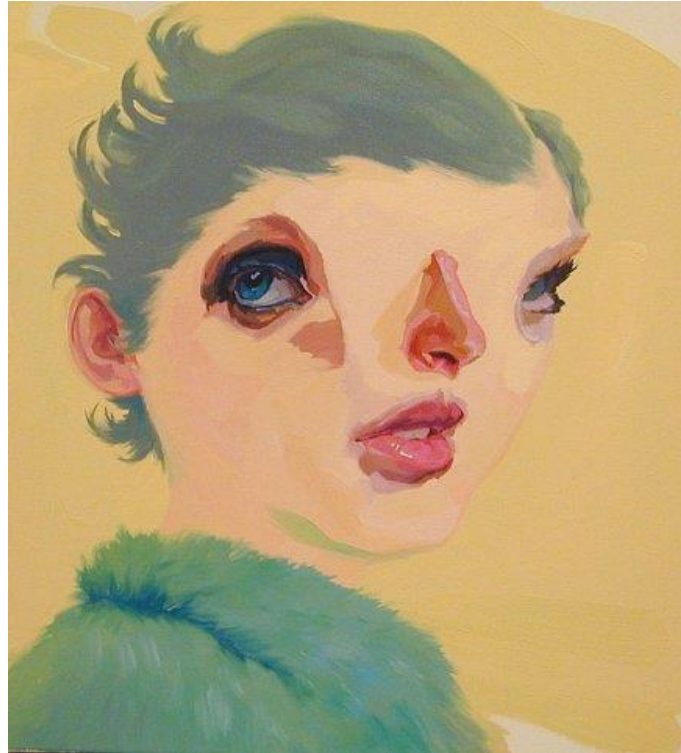
Morning Margherita , Yi Chen, 2005 14

Yi Chen is a Chinese artist who creates faces by using a collage method. Distortion of the eye, similar to that of Hester, is seen in Yi Chen's artwork; the eye is recognisable however the two vastly differ in size. Chen collects the imagery he uses for his faces from pop culture and Asian fashion magazines. He pulls together random features off different faces and arranges it to create a new version of the human face. Once this stage is completed he then uses the collages as models and repaints the face 15 . This is again a different method to that of artists who have had a model sit for them to paint. This method is similar to that of Harding Meyer who uses unknown faces. A lot of Chen's artworks feature dramatically oversized and un-proportioned heads, large unrealistic features and bulging eyes.