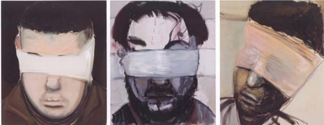
The Blindfolded , Marlene Dumas, 2002 17

portrait is uncomfortable to examine, as the viewer is prevented from connecting with the subjects in the way they usually could in a portrait.