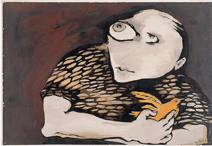
Child with Yellow Bird , Joy Hester, 1957 13

Australian artist Joy Hester uses a different approach with her distortion of the eyes, as seen in Child with Yellow Bird , created in 1957. The artwork consists of a child holding and protecting a yellow bird, situated off centre of a dark and moody background. The colours used are all very neutral, the only pop of colour is the yellow bird. The child is shielding the bird with great fear in his eyes and he is looking up at what appears is going to harm the bird. There is an over exaggeration of the size of the left eye, taking attention away from the incomplete smaller right eye. At first glance the smaller eye almost fades away, but the shading around the eye pulls it back in. Hester may perhaps have made the large eye to be the main focal point of this piece, as the size of the eye really emphasizes the fear of the child. A very similar technique was used in The Weeping Woman ; where the distorted eyes reflect the emotional state of Dora Maar. The distortion of the eyes can tell the viewer a lot about this child in Hester's work. The child is afraid and anxious; he is staring intensely at the mysterious danger. The other features of the face are also vastly distorted and out of proportion. There is no nose, the jaw is small and the size of the head is large and round.