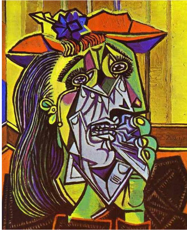
The Weeping Woman , Pablo Picasso, 1937 10

Pablo Picasso was a Spanish artist and one of the most important figures of the 20th century 11 . Many of his artworks had a major impact on the art world, one of these artworks was The Weeping Woman created in 1937. The Weeping Woman is a cubist style painting; vibrant geometric shapes create a portrait of a very distressed woman. The sharp distinct edges carry the viewer's eye all around the painting, and the points of the triangular shapes near the woman's hands all point up towards her eyes. The woman and inspiration behind this painting was Dora Maar. Maar was Picasso's mistress, who suffered from mental illness, which is clearly portrayed in this portrait of her 12 . This painting has the power to emotionally connect with the viewer, once this portrait is examined in depth the viewer can sense the pain Maar was feeling. The colours used reflect her emotion. The subject's skin is green;