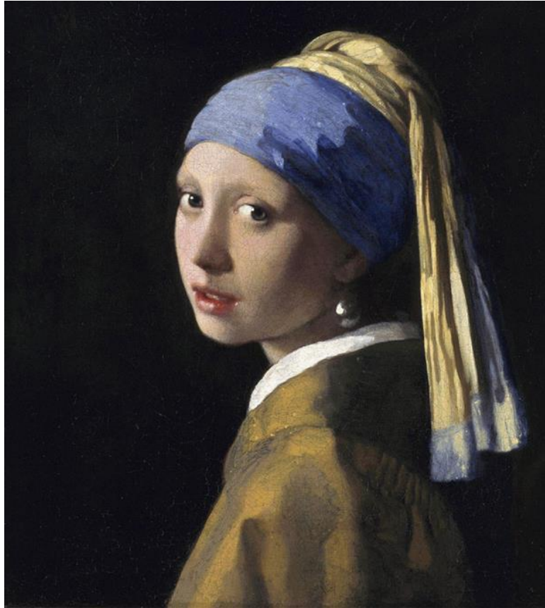
Girl with a Pearl Earring , Johannes Vermeer, 1665 5

Girl with a Pearl Earring is another famous painting where the eyes are the focus, and like the Mona Lisa is very famous for the gaze of the subject. This portrait was created in 1665 by the Dutch painter Johannes Vermeer. The young girl in the portrait is said to be a maid who worked in the artist's home 6 . The girl is wearing a layered dress, a headscarf and of course the famous pearl earring. The white of the collar, eyes and pearl earring are highlighted against the dark and subdued colours of the painting, drawing more attention to the whites of the eyes. The girl appears to be sweet and innocent, she has a clear and pure complexion. The left side of her face is very pale, the right side of her face darkens and almost disappears in to the background. The girl's body is on an angle and has her head turned