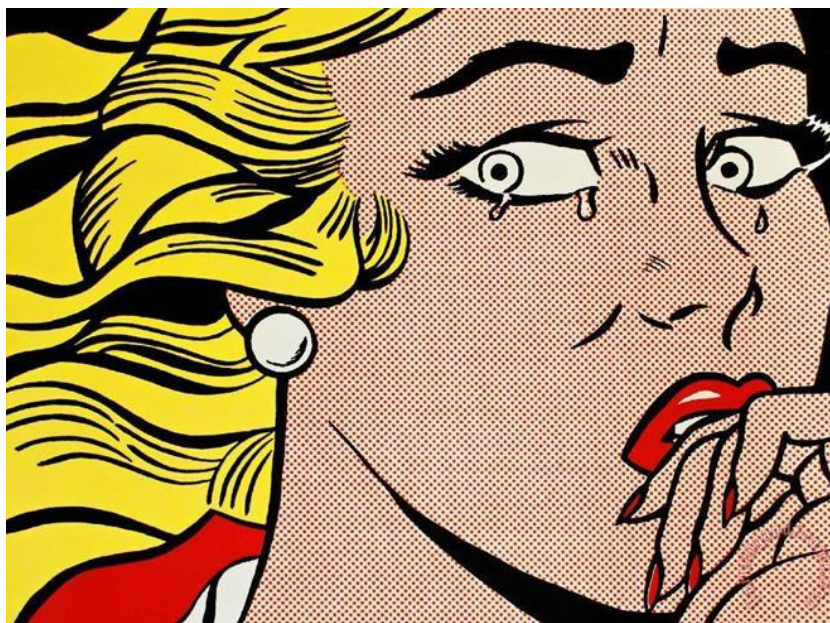
Crying Girl , Roy Lichtenstein, 1963 7

slightly backwards looking over her left shoulder. This is quite different from a traditional portrait pose, as the subject would usually have their body open to the viewer and not turned away. The way she is gazing over her shoulder so peacefully is very powerful, it automatically captures the viewers' attention. The soft gaze and the slight opening of her mouth is quite seductive. The wide constant gaze of her eyes may also suggest that she is looking at something that is making her scared or shy. The eyes appear to be glassy which also may suggest that the girl has been crying. The way the girl is looking back over her shoulder appears that something has caught and captured her attention, this is what then captures the viewer's gaze as we begin to wonder who is this girl? And what is her relationship and connection to this artist?