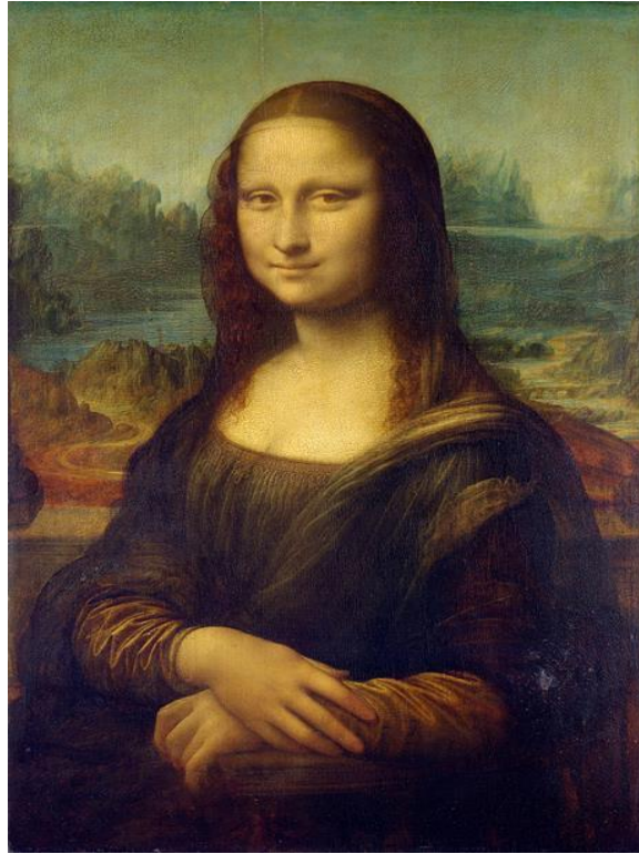
Mona Lisa , Leonardo Da Vinci, 1506 1

The Mona Lisa , created by the Italian Renaissance artist, Leonardo Da Vinci, has one of the most famous gazes in art history. It is the most visited, written about, sung about, parodied piece of artwork in the whole world 2 . From the moment the Mona Lisa was completed in 1506, da Vinci has set a high standard for all portraits to follow. One feature that has made the Mona Lisa so remarkable is her powerful gaze. The artwork consists of a half-length portrait of a woman named Lisa Gherardini 3 . She is situated in what appears to be a window that overlooks a valley. There is a winding road featured in the background, leading towards a river. Further in the distance there are mountains, giving the overall painting depth.